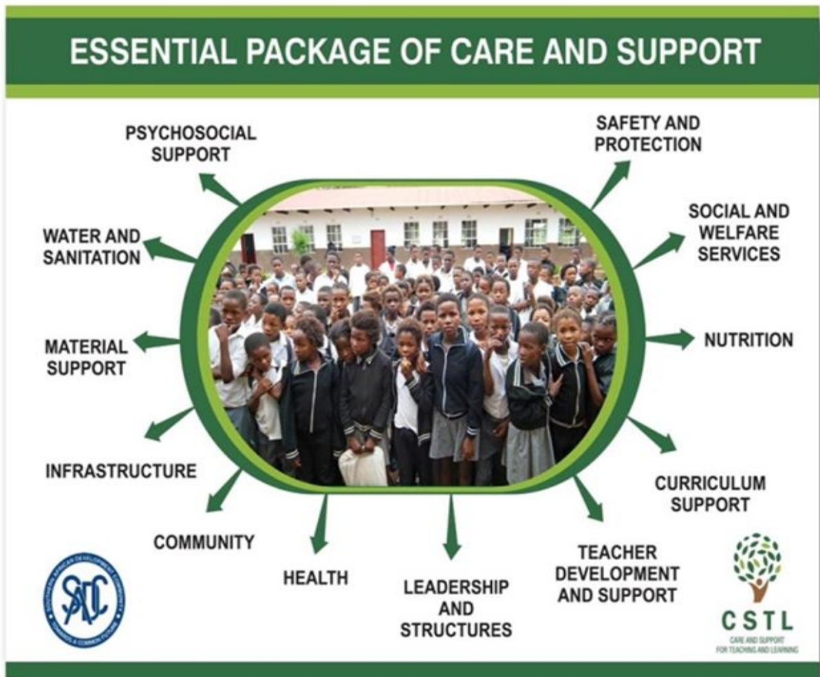
FIGURE 2: ESSENTIAL PACKAGE OF CARE AND SUPPORT

The comprehensive set of services are all equally important for the realisation of the desired educational outcomes and must be afforded the same priority status in national educational sector initiatives to improve educational outcomes. However, they cannot all be delivered by the education sector alone.